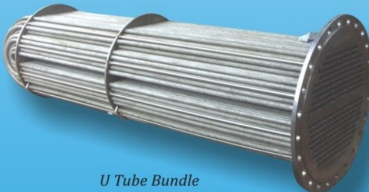
U Tube Bundle