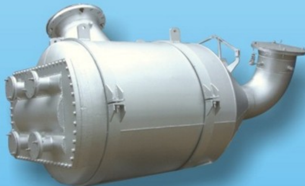
Gas Inter Cooler